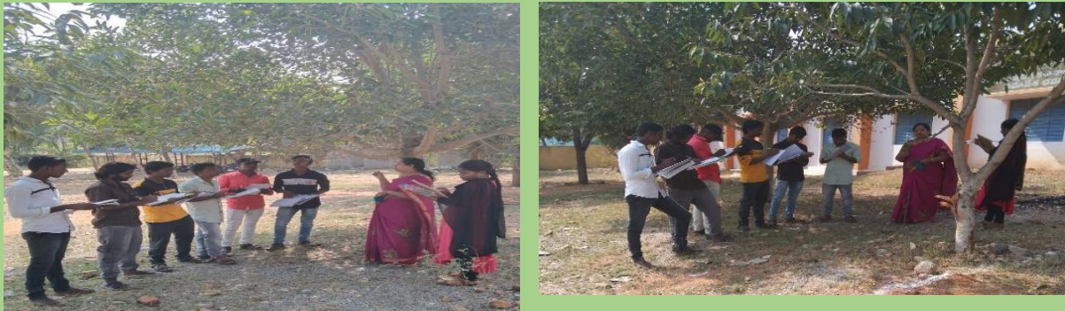
Plantation by final year BZC students at Department of Botany in the college.

The Department of Botany headed by Dr S Swarupa Rani of GVRS Government Degree College conducted the green audit on the college premises. Students participated in the event.