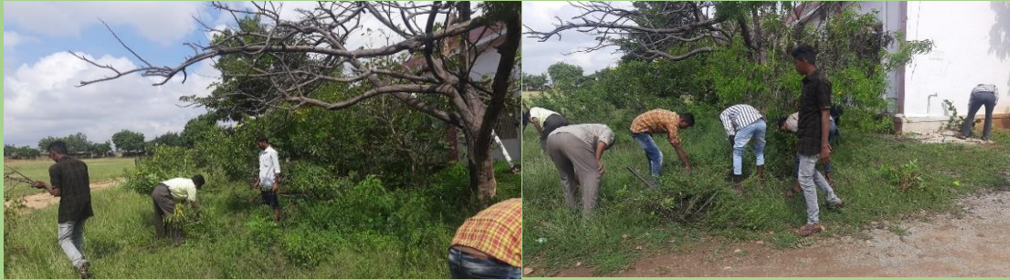
Cutting the branches falling on the roof of the classrooms to arrest water logging and prevent seepage.