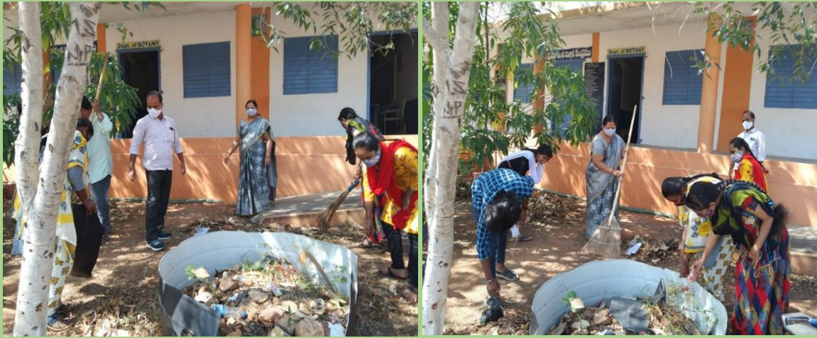
Cleaning open air class room